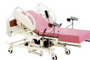
CAMEL 525 MOTORIZED OBSTETRIC LABOR & RECOVERY BED - 3 FUNCTION