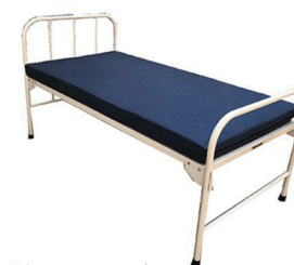
CAMEL 516 GENERAL WARD BED SIZE : L 1900mm X W 900 mm X H 560mm