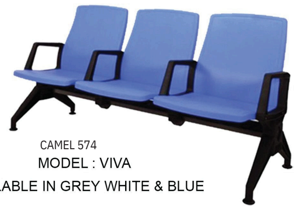
CAMEL 574 MODEL : VIVA AVAILABLE IN GREY WHITE & BLUE