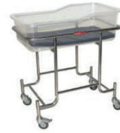
CAMEL 536 BABY TROLLEY - S.S SIZE : L 750mm X W 455mm X H 1000mm