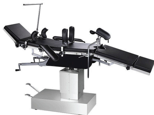
CAMEL 560 Hydraulic Operation Table