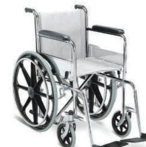
CAMEL 557 NON FOLDING WHEEL CHAIR S.S