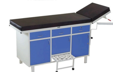
CAMEL 520 EXAMINATION COUCH SIZE : L 1830mm X W 575 mm X H 850mm