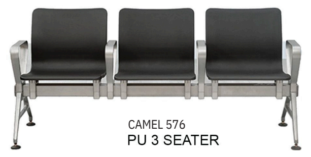
CAMEL 576 PU 3 SEATER

NOTE : ALL MODELS ARE AVAILABLE IN 4 / 3 / 2 / 1 SEATER