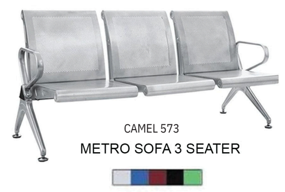
CAMEL 573 METRO SOFA 3 SEATER