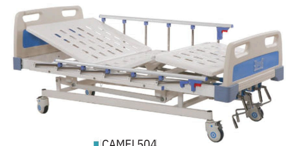
CAMEL 504 MANUAL ICU BED 5 FUNCTION (DELUXE)