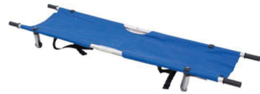
CAMEL 532 ALUMINIUM FOLDING STRECHER