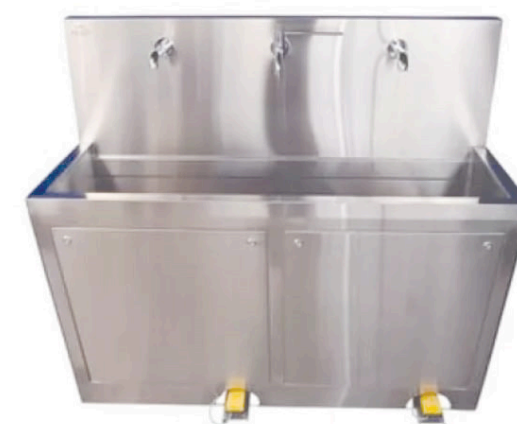
CAMEL 567 Footoperated Scrub Sink