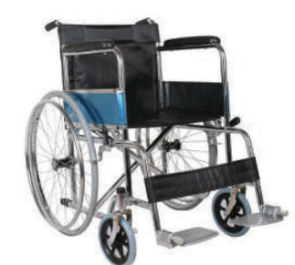
CAMEL 558 FOLDING WHEEL CHAIR