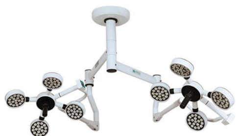
CAMEL 565 OT Lights