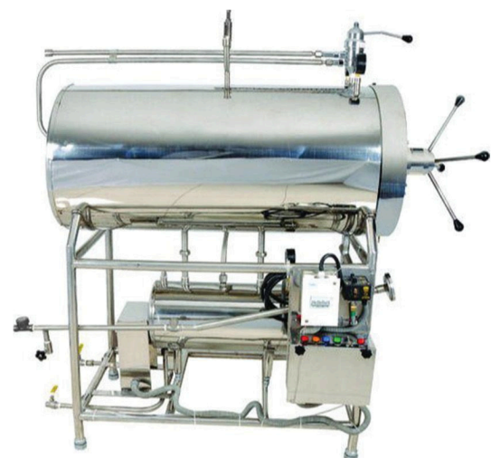
CAMEL 562 Horizontal Cylinder High Pressure Sterilizer [Auto Clave]