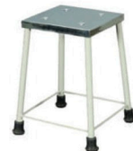
CAMEL 544 BED SIDE STOOL WITH S.S TOP SIZE : L 405mm X W 405 mm X H 455mm