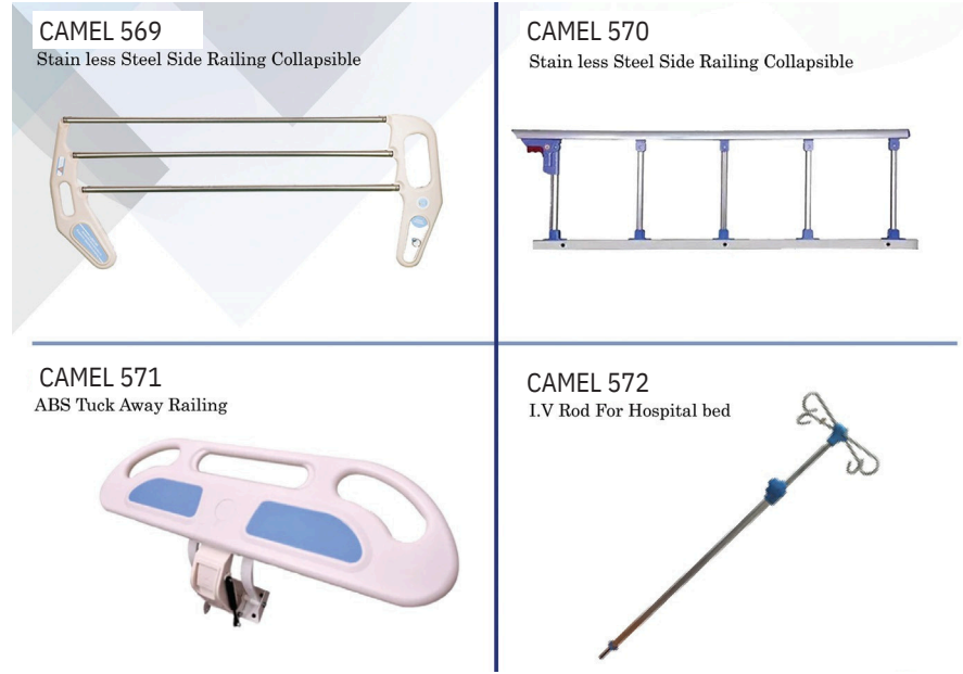
CAMEL 569 Stain less Steel Side Railing Collapsible