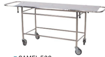
CAMEL 530 STRETCHER ON TROLLEY - S.S SIZE : L 2030mm X W 610mm X H 870mm