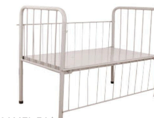
CAMEL 518 PEDIATRIC BED CLASSIC SIZE : L 1370mm X W 625mm X H 560mm