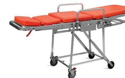
CAMEL 527 Ambulance Stretcher Trolley