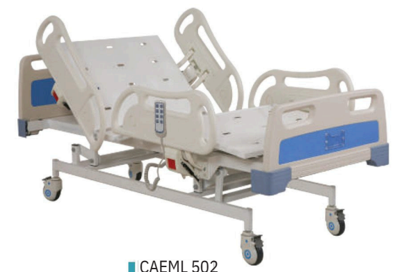
CAEML 502 MOTORIZED ICU BED 5 FUNCTION (EXCEL)