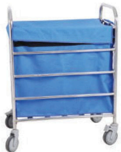
CAMEL 541 SOILED LINEN TROLLEY BIG - S.S SIZE : L 790mm W 560mm X H 1030mm