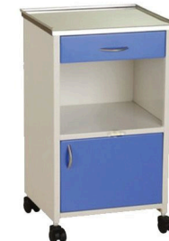
CAMEL 553 BED SIDE LOCKERS MS/ABS (DELUXE) SIZE : L 460mm X W 450mm X H 820mm