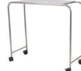
CAMEL 550 OVER BED TABLE - S.S SIZE : L 1115mm X W 445mm X H 965mm