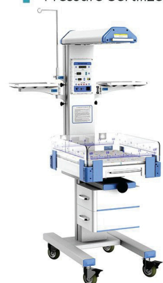
CAMEL 564 Baby Warmer