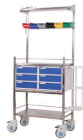
CAMEL 535 EMERGENCY CRASH CART - S.S