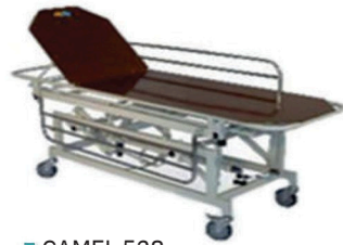
CAMEL 528 TRAUMA CARE RECOVERY TROLLEY By Screw Mechanism