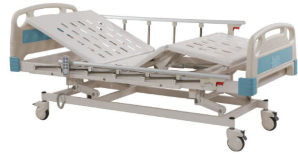
CAMEL 501 MOTORIZED ICU BED 5 FUNCTION (PREMIUM)