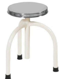
CAMEL 539 REVOLVING STOOL SIZE : W 290mm X H 425mm to 675mm