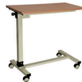
CAMEL 556 ADJUSTABLE BED SIDE TABLE WITH KNOB