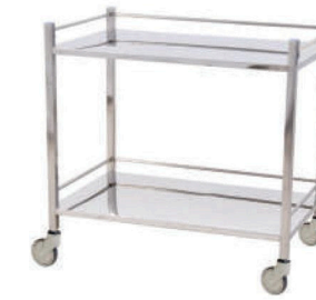
CAMEL 547 INSTRUMENT TROLLEY - S.S Available in various sizes