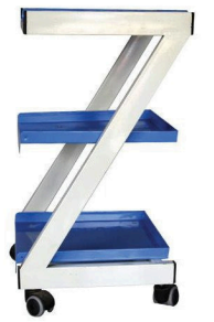
CAMEL 548 ECG TROLLEY-Z -MS/SS