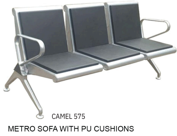
CAMEL 575 METRO SOFA WITH PU CUSHIONS