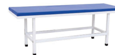
CAMEL 517 ATTENDANT BED SIZE : L 1830mm X W 610mm X H 380mm