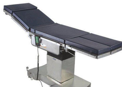
CAMEL 561 Remote Controlled Operation Table