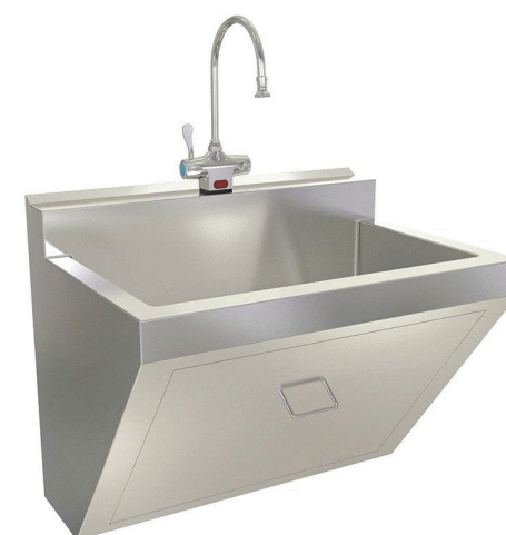
CAMEL 568 Wall Mounted Scrub Sink