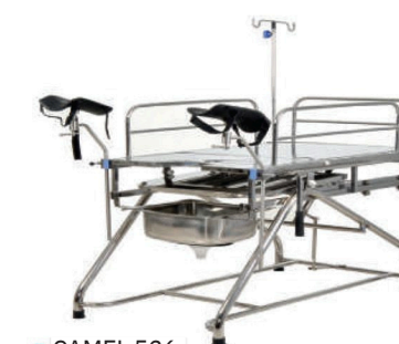
CAMEL 526 TELESCOPIC OBSTETRIC & GYNAEC TABLE - S.S. SIZE : L 1830mm X W 760 mm X H 760mm