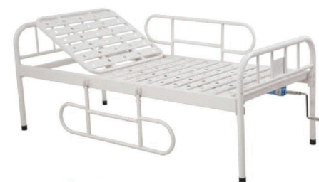
CAMEL 514 MANUAL SEMI FOWLER BACKREST BED 1 FUNCTION (CLASSIC)