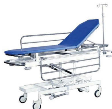
CAMEL 512 EMERGENCY RECOVERY TROLLEY