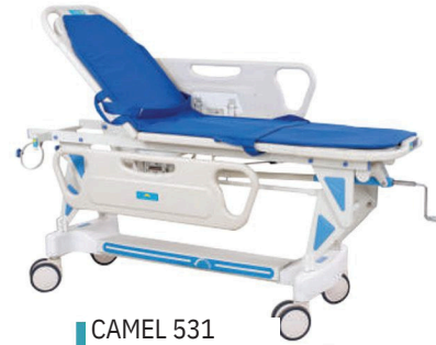
CAMEL 531 ABS PATIENT TRANSFER TROLLEY