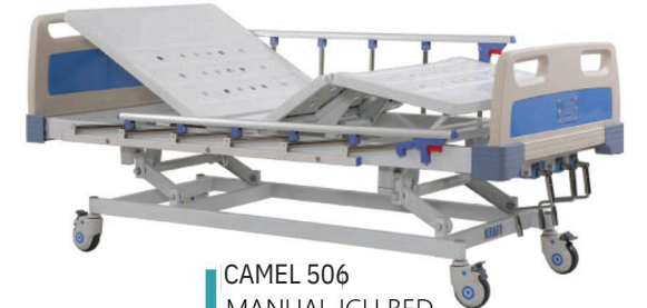
CAMEL 506 MANUAL ICU BED 3 FUNCTION (DELUXE)