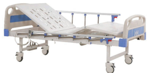
CAMEL 507 MOTORIZED FOWLER BED 2 FUNCTION (PREMIUM)