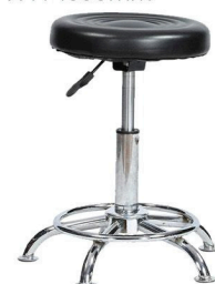
CAMEL 540 REVOLVING STOOL SIZE : W 290mm X H 425mm to 675mm