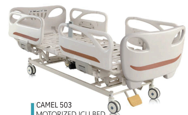
CAMEL 503 MOTORIZED ICU BED 5 FUNCTION (EXCEL PLUS)