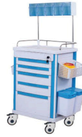
CAMEL 534 ABS ANESTHESIA TROLLEY