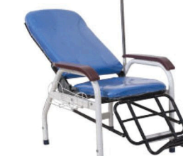
CAMEL 524 BLOOD DONATION COUCH