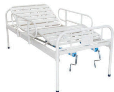
CAMEL 510 MANUAL FOWLER BED 2 FUNCTION (CLASSIC)