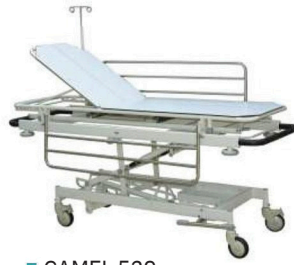
CAMEL 529 HYDRAULIC TRAUMA CARE RECOVERY TROLLEY