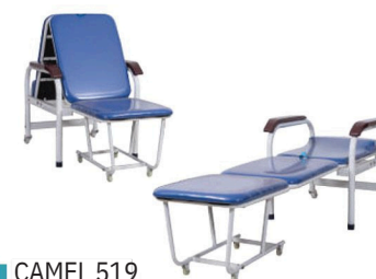
CAMEL 519 ATTENDANT BED CUM CHAIR