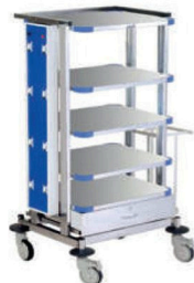
CAMEL 542 MONITOR TROLLEY M.S