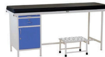
CAMEL 522 SIMPLE EXAMINATION COUCH SIZE : L 1830mm X W 575mm X H 850mm