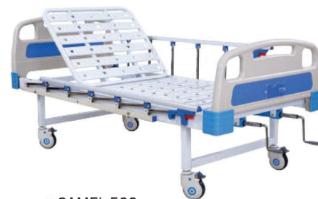
CAMEL 509 MANUAL FOWLER BED 2 FUNCTION (ECONOMY)