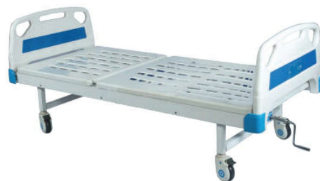
CAMEL 511 MANUAL SEMI FOWLER BACKREST BED 1 FUNCTION (DELUXE)