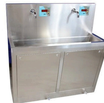
CAMEL 566 Scrub Sink with Sensor taps