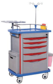
CAMEL 533 ABS EMERGENCY TROLLEY