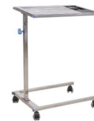
CAMEL 549 MAYO'S TROLLEY - S.S SIZE : L 560mm X W 445mm X H 810 to 1270mm