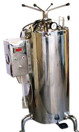
CAMEL 563 Vertical High Pressure Auto Clave