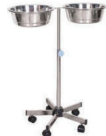
CAMEL 538 BOWL STAND DOUBLE - S.S SIZE : H 840 mm X D 355 mm