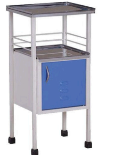
CAMEL 552 BED SIDE LOCKER MS