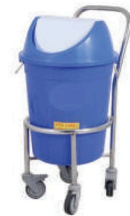
CAMEL 543 WASTE CARRYING TROLLEY S.S