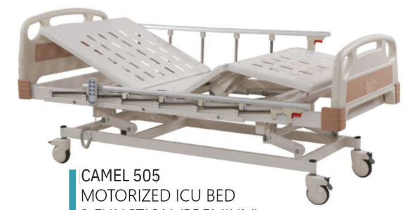
CAMEL 505 MOTORIZED ICU BED 3 FUNCTION (PREMIUM)