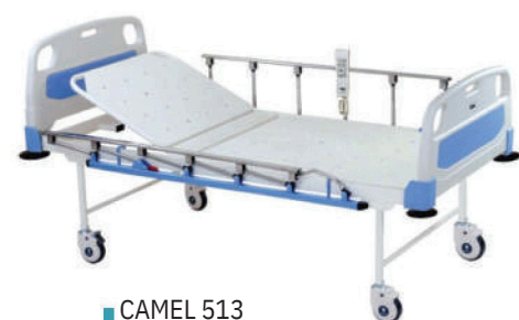
CAMEL 513 MOTORIZED SEMI FOWLER BACKREST BED 1 FUNCTION (PREMIUM)