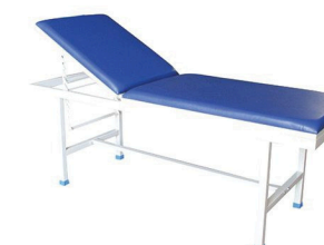
CAMEL 521 EXAMINATION COUCH WITH BACKREST SIZE : L 1830mm X W 575 mm X H 850mm