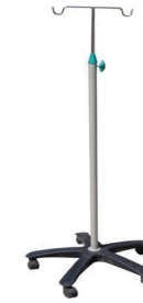
CAMEL 545 SALINE STAND - SS/MS