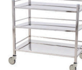
CAMEL 551 INSTRUMENT TROLLEY - S.S Available in various sizes