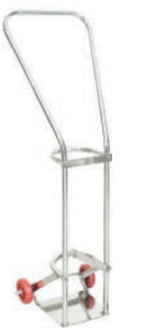
CAMEL 559 CYLINDER TROLLEY S.S / M.S 10 LTRS