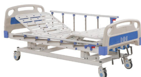
CAMEL 515 MANUAL ICU BED 3 FUNCTION (ECONOMY)