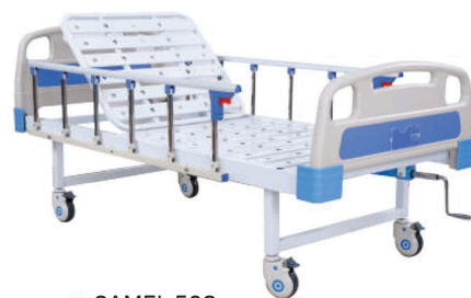
CAMEL 508 MANUAL SEMI FOWLER BACKREST BED 1 FUNCTION (ECONOMY)