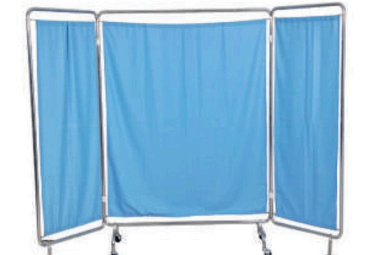
CAMEL 555 BED SIDE SCREEN S.S / M.S SIZE : H 1675mm X W 2440mm