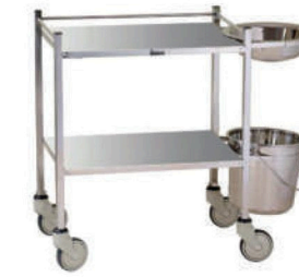
CAMEL 546 DRESSING TROLLEY Available in various sizes